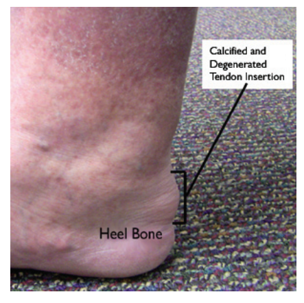
Insertional Achilles tendinitis