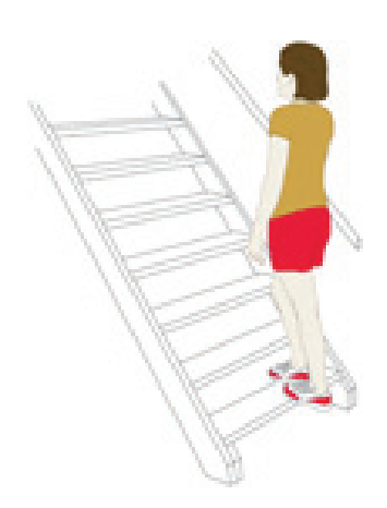
Bilateral heel drop

AAOS does not endorse any treatments, procedures, products, or physicians referenced herein. This information is provided as an educational service and is not intended to serve as medical advice. Anyone seeking specific orthopaedic advice or assistance should consult his or her orthopaedic surgeon, or locate one in your area through the AAOS "Find an Orthopaedist" program on Ortholnfo.org.