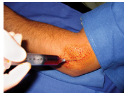
An injection of PRP is used to treat tennis elbow.

OrthoInfo.org provides expert information about a wide range of musculoskeletal conditions and injuries. All articles are developed by orthopaedic surgeons who are members of the American Academy of Orthopaedic Surgeons (AAOS). To learn more about your orthopaedic health, please visit orthoinfo.org .