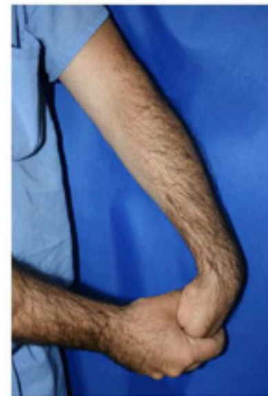
Wrist stretching exercise with elbow extended.